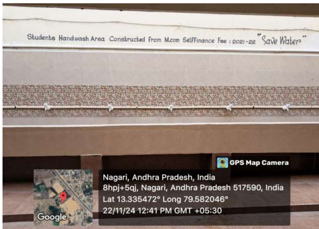
Pumps for water distribution