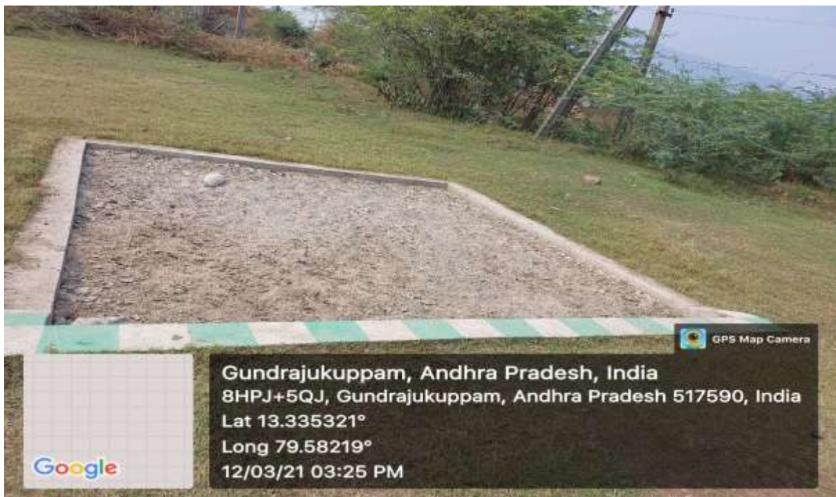
Rain water pit 2 with standard measurement of 4.27 m width & 2.86 m length