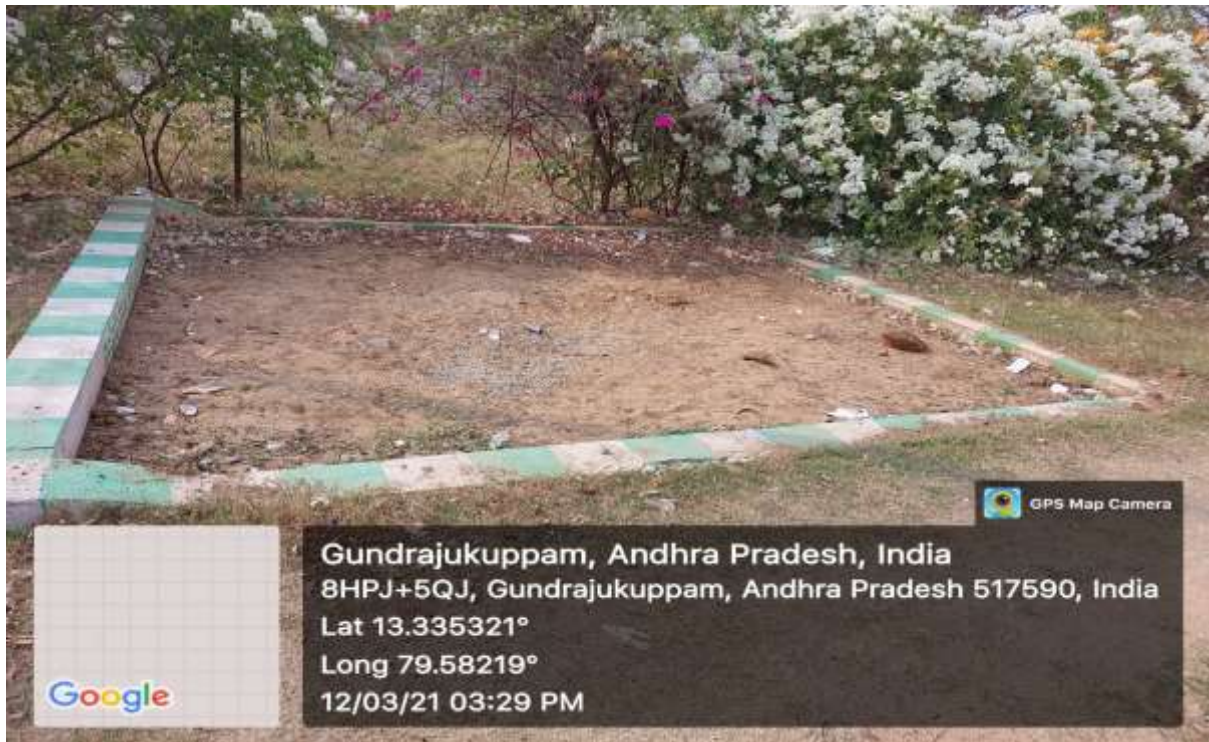
Rain water pit 1 with standard measurement of 4.27 m width & 2.86 m length